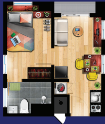
1-bedroom Unit B2 Tower 2 6th - 10th Floor 31.30 sq. m.