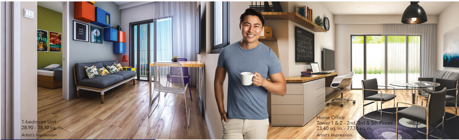
1-bedroom Unit 28.90 - 38.10 sq. m. Artist's Impression