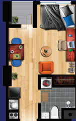
Studio Unit A3 Tower 1 Tower 2 6th - 18th Floor 6th - 10th Floor 28 sq. m.