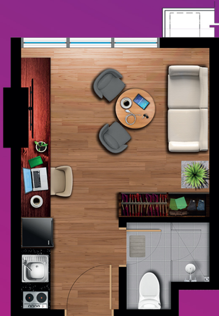
Standard Studio Home Office Unit (HO-A1)

Grow your business out of the convenience of home—Vertex Central offers SOHO units ideal for web-based work, small businesses, and startups.