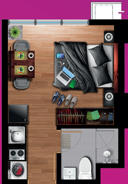
Standard Studio Unit (RU-A1)

Young couples, busy professionals, growing families, and many more will feel at home at Vertex Central, where future homeowners can choose from studio to 1-bedroom configurations.