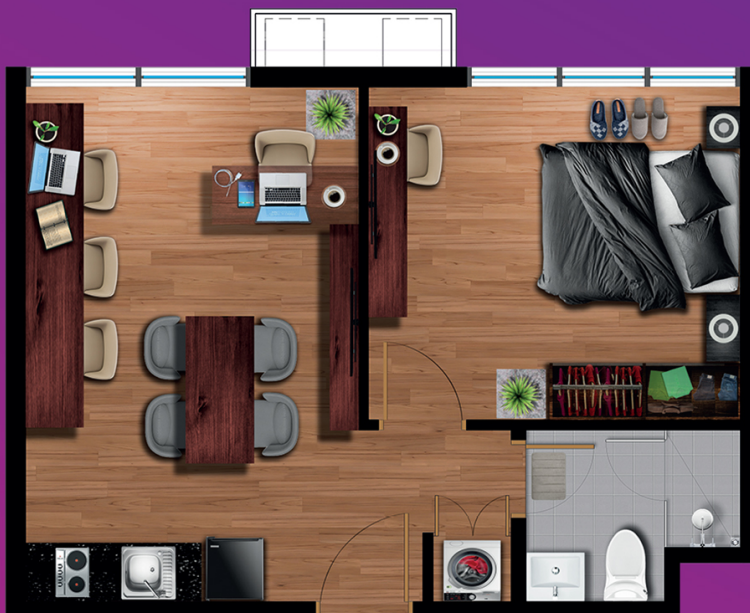
Standard 1-Bedroom Home Office Unit (HO-B1)