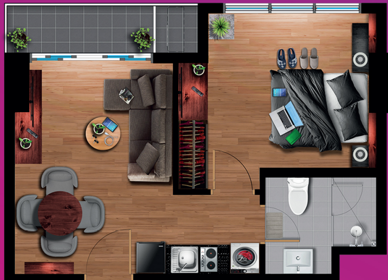
Standard 1-Bedroom Unit (RU-B1)